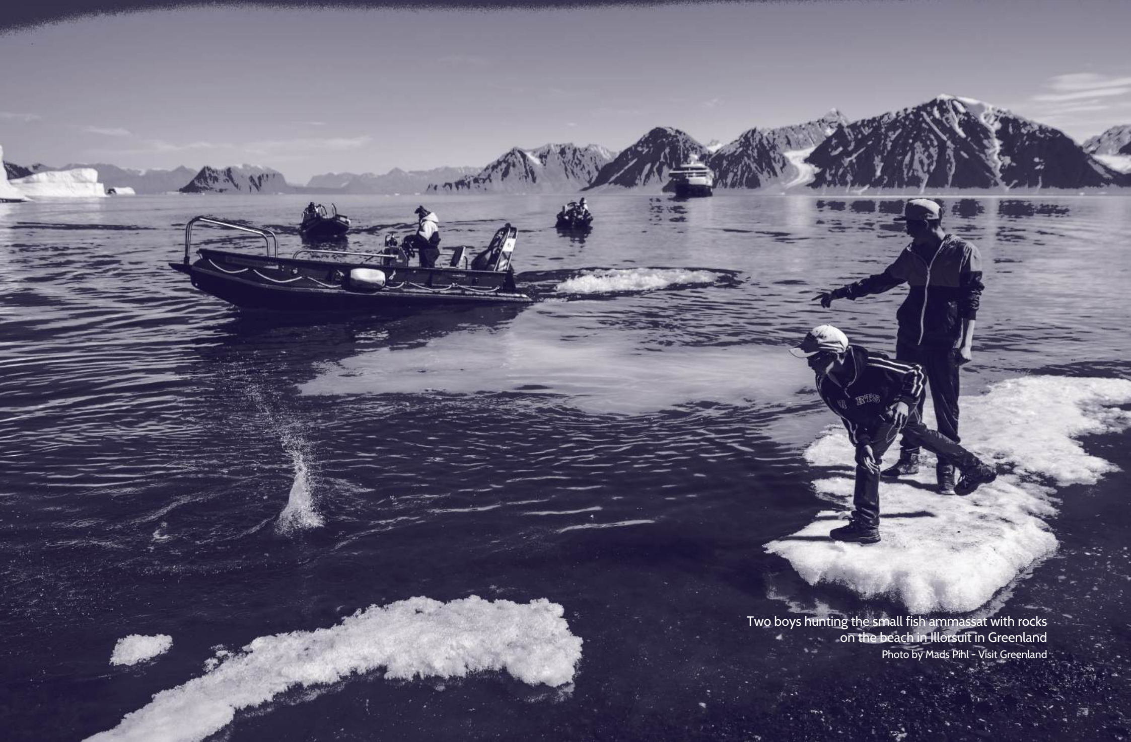
Two boys hunting the small fish ammassat with rocks on the beach in Illorsuit in Greenland