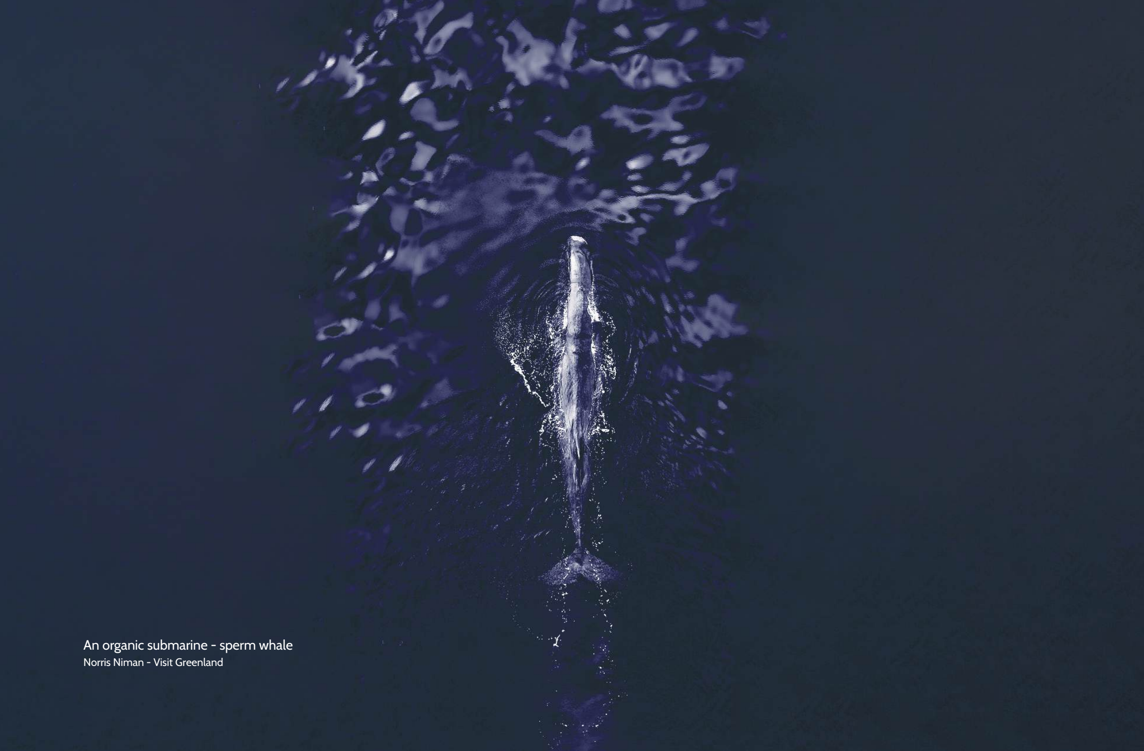
An organic submarine - sperm whale