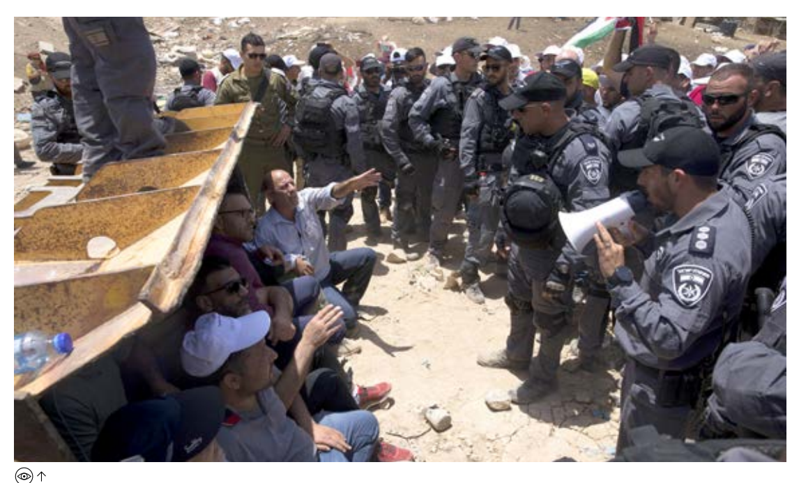
Demonstrators block an Israeli army bulldozer from preparing the ground for the demolition of the Palestinian Bedouin village of Khan Al-Ahmar in the occupied West Bank, on 4 July 2018

On 29 November 2020, the Supreme Court ruled on this petition, stating that, if the residents of Khan Al-Ahmar did not reach a settlement with the Israeli military and civil administrations, the demolition orders would be implemented on 15 July 2021. 1366 Following the ruling, the Israeli authorities asked the court for more time to prepare plans for the implementation of the demolition order citing Covid-19 and considerations relating to the "diplomatic-security situation". This prompted a second petition to the Supreme Court by Regavim. When the court scheduled a hearing on this for 6 March 2022, it criticized the state for "inaction and feet dragging" over the demolitions. 1367