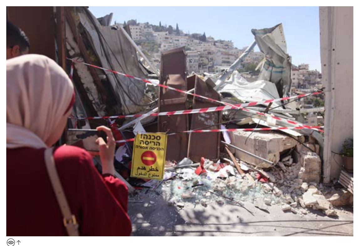
Palestinian residents stand by the rubble of a shop demolished by Israeli authorities in the Silwan neighbourhood of occupied East Jerusalem, on 29 June 2021

Arrests often lead to other forms of abuse. Over the years, Amnesty International and other organizations have documented how Israeli security forces have used unnecessary force to arrest or detain Palestinian children in East Jerusalem and elsewhere in the OPT.<sup>1332</sup>