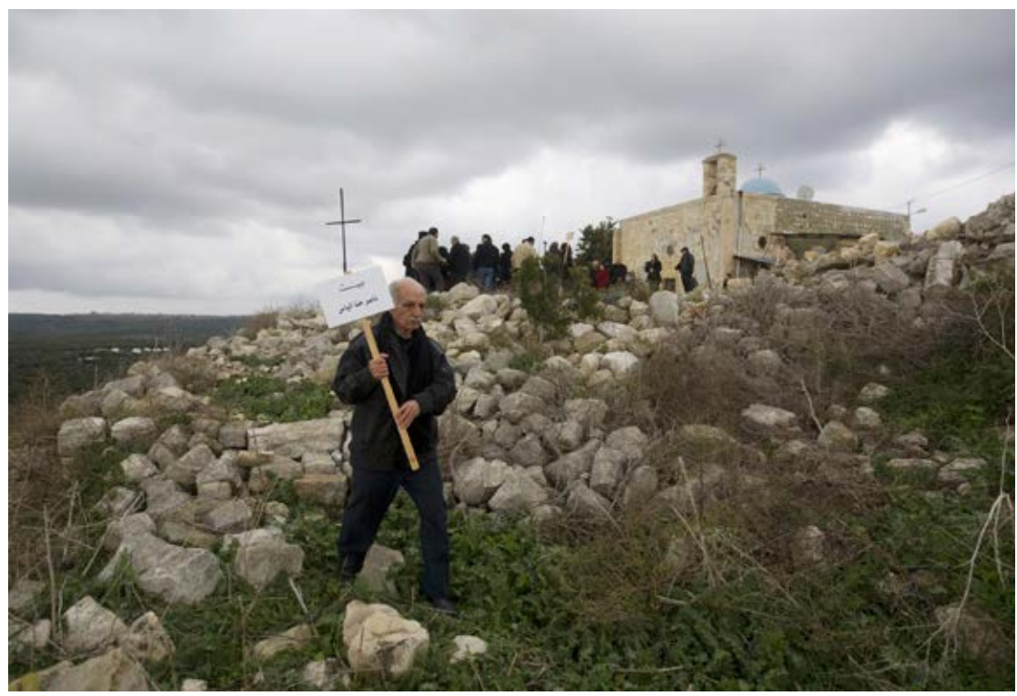
A Palestinian man walks in the rubble of his native Palestinian village of Iqrit, in the Galilee region of Israel, to place the name of the owner of a destroyed house during a visit on the occasion of Christmas on 25 December 2011

The case of IDPs from the village of Iqrit is a prime example of Israel's use of military rule to dispossess Palestinians and prevent them from returning to their homes and villages – undermining the official narrative at the time that military rule was necessary to maintain security – while simultaneously allowing the state to confiscate Palestinian property under the Absentees' Property Law.