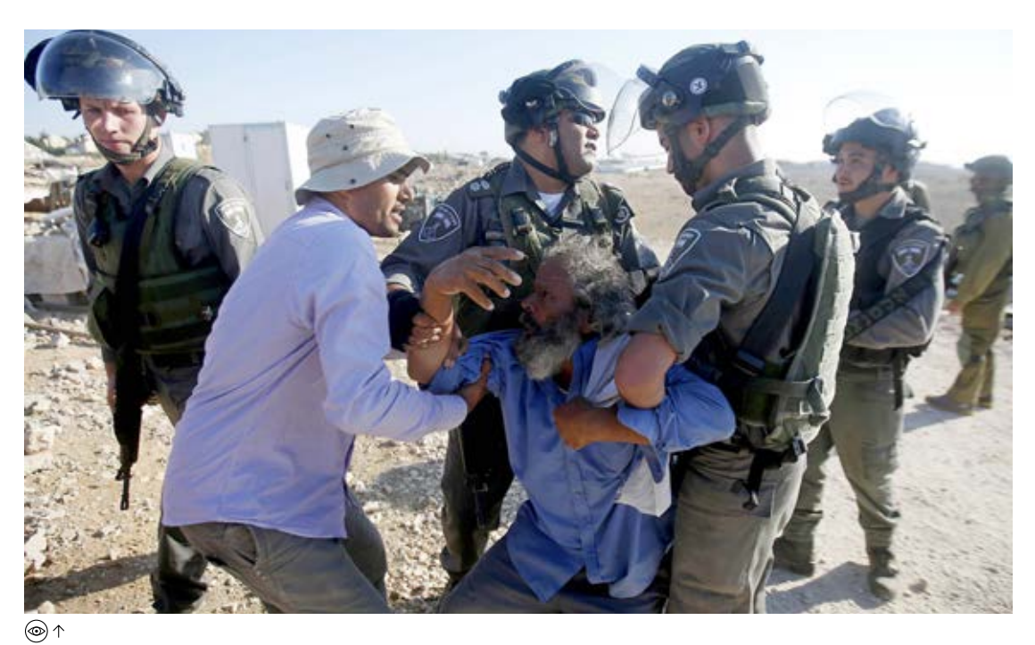
Israeli security forces pull away a Palestinian man who was protesting the demolition of a number of Palestinian homes built without a permit in his village of Umm Al-Khair in the occupied West Bank, on 9 August 2016

The most recent demolition in Khirbet Susiya took place on 20 April 2021 when Israeli authorities demolished a tent in which a family lived. 836