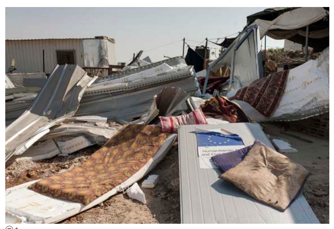
Belongings from a Palestinian family house are scattered on the ground, after the house was demolished earlier that day by Israeli forces in the village of Umm Al-Khair in the occupied West Bank, on 9 August 2016