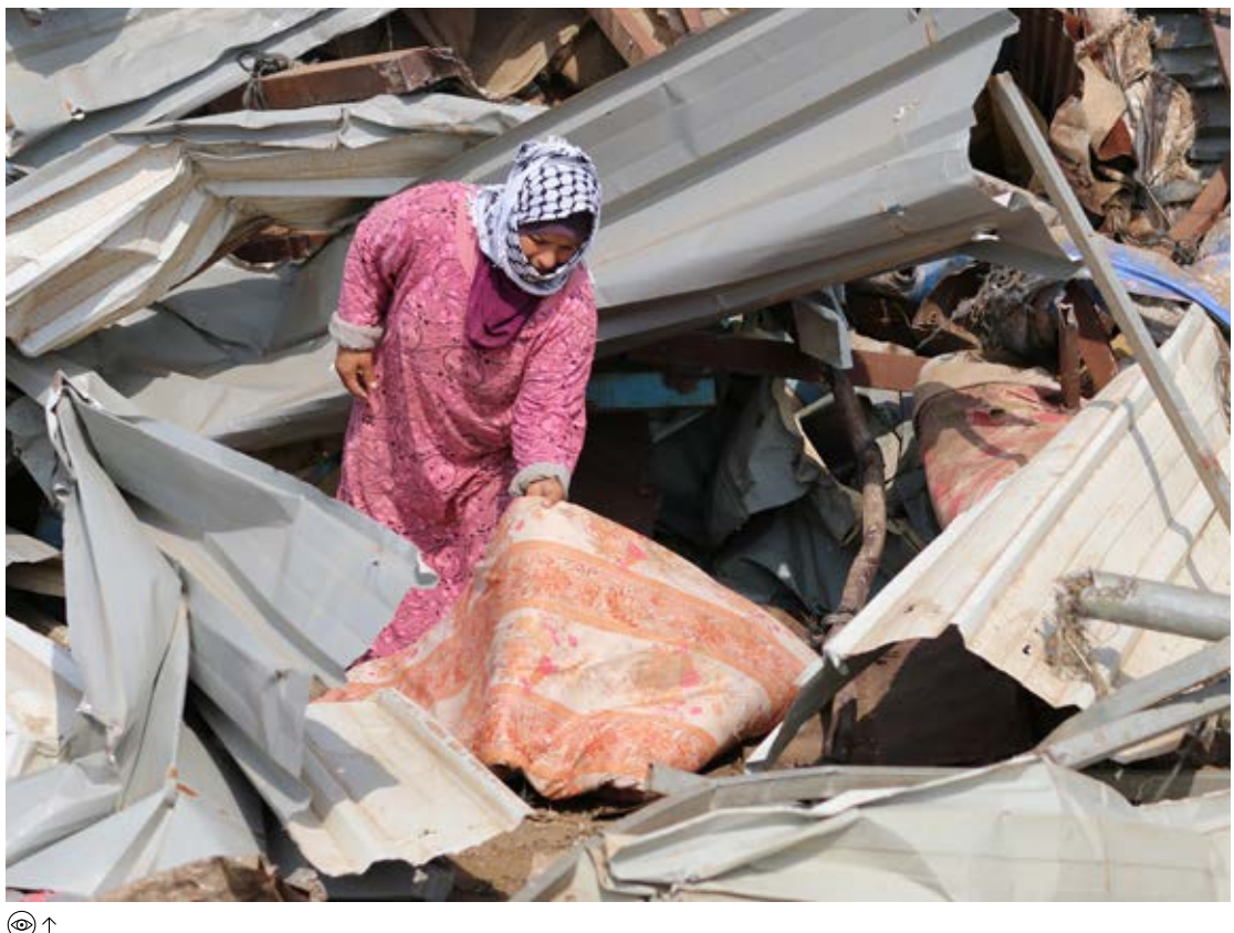
A Palestinian woman examines the damage caused to her house, after Israeli forces demolished it earlier that day in the hamlet of AI-Hadidiya in the Jordan Valley region of the occupied West Bank, on 11 October 2018. The demolition was conducted on grounds of

building without an Israeli-issued building permit