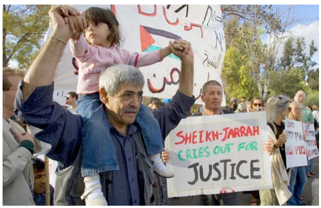
Palestinian, Israeli and foreign activists hold anti-settlement and anti-occupation placards outside a Palestinian house occupied by Jewish settlers in the Sheikh Jarrah neighborhood of occupied East Jerusalem during a weekly protest against Israeli settlement on 29 October 2010