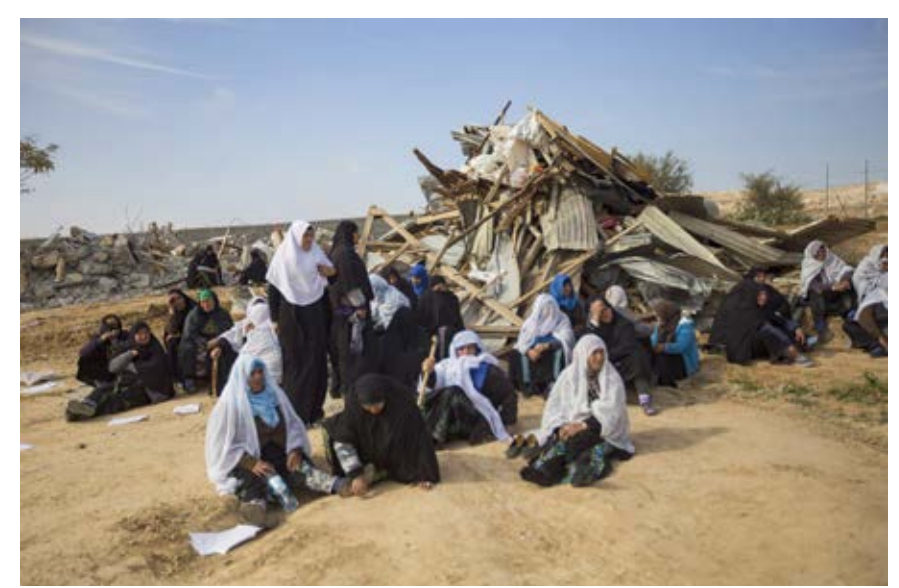
Bedouin women sit next to the ruins of their demolished houses in the unrecognized Bedouin village of Umm Al-Hiran, in the Negev/Naqab region of Israel, on 18 January 2017