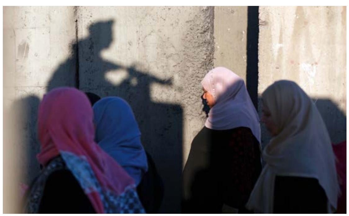
Palestinians wait to cross the Qalandia checkpoint between Ramallah and East Jerusalem, both in the occupied West Bank, as they head to the Al-Aqsa Mosque compound in East Jerusalem for the first Friday prayers of the Muslim holy month of Ramadan on 2 June 2017

The past 20 years have been one form of torture and these coming ones are another. The straw that broke the camel's back was my 20-year-old daughter getting sick. On December 2020, her kidneys failed and she started undergoing kidney dialysis. She has dialysis three times a week in a hospital in Ramallah and I have to accompany her. These weekly trips are extremely difficult as they are; we also undergo the terror of being caught by random Israeli checkpoints that would probably lead to my deportation, that is with us being merely 20 minutes away by car. Her doctors determined that she needs a transplant – she needs to undergo this procedure in Jordan where she will require a six-month recovery period. Six months of me, her mother, not being able to be with her to support her during this extremely difficult period.<sup>331</sup>