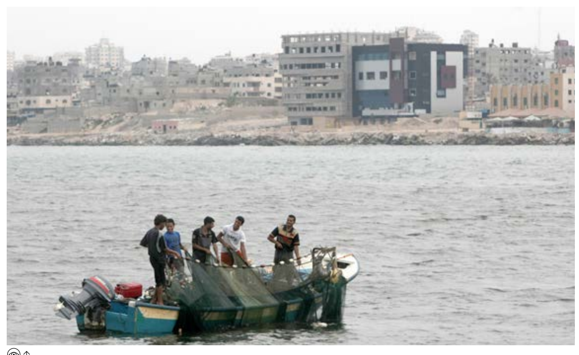
Palestinian fishermen prepare their nets near the port of Gaza City in the Gaza Strip on 30 September 2012, a day after a Palestinian fisherman was killed and another was wounded by the Israeli navy, which was reinforcing restrictions on fisheries

Fishermen in Gaza pay a heavy price for working in this sector. We suffer from the blockade and severe restrictions on movement by Israel's navy and now with measures taken to stop the spread of Covid-19, there is even a greater economic uncertainty and increased concern for the food security of Gaza's civilian population. For example, it is now sardine season, one of the most profitable fishing seasons of the year. But with the Israeli restrictions on access to the fishing zone it enforces in Gaza's maritime area, the frequent changes it makes to its demarcation, and the violent enforcement methods it employs thwart us from making any profit during this season. All these measures are severely affecting the livelihoods of thousands of fishermen, undermining what was once an important sector in the Gaza Strip's economy.