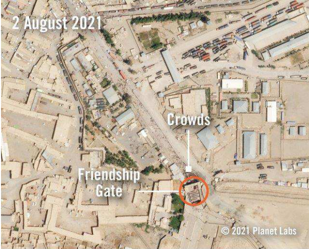
Spin Boldak border crossing. 2 August 2021. Planet Labs.

Afghans who tried to cross land borders, an Afghan researcher, and the UN agency in charge of refugees (UNHCR), all told Amnesty International that the Afghan people were also prevented from seeking refuge abroad because most of the land border crossings were closed for asylum seekers. 185