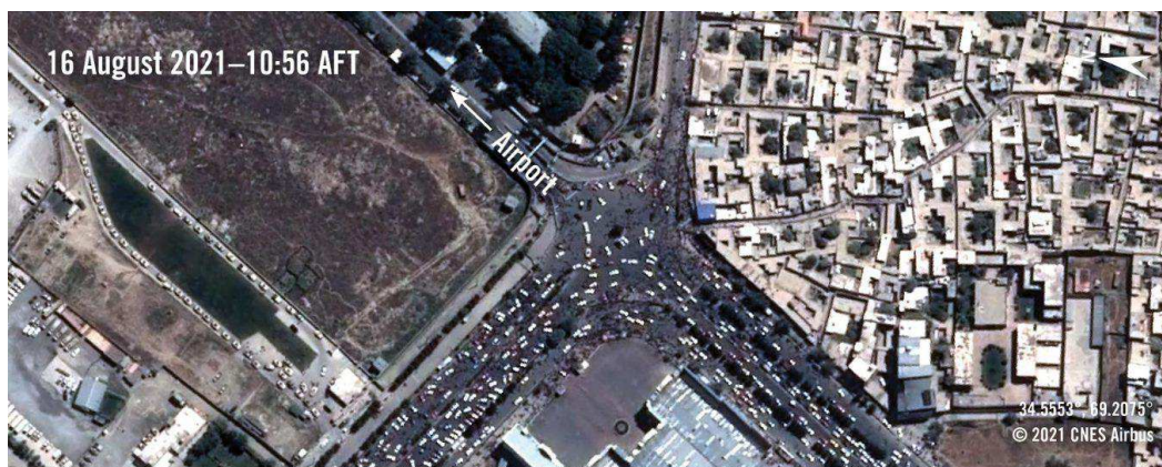
Kabul Airport vicinity. 16 August 2021.

In this report, Amnesty International, International Federation for Human Rights (FIDH) and the World Organisation against Torture (OMCT) have documented incidents of human rights violations that have taken place in Afghanistan since the takeover by the Taliban on 15 August. This report calls on the UN Human Rights Council (UNHRC) to take decisive action to establish a robust independent investigative mechanism to monitor and report on human rights abuses committed in violation of international human rights law, and to contribute to accountability for crimes under international law. Human rights defenders, journalists, and others who are targeted for their work must be evacuated and given safe passage if they wish to leave Afghanistan; and women and girls, and ethnic and religious minorities who are targeted because of their gender, ethnic, and religious identity, must be guaranteed protection. All those who wish to leave Afghanistan must be assured the right to seek asylum. At the same time, the Office of the Prosecutor of the International Criminal Court must receive assistance from the international community to immediately recommence its investigations into crimes under international law committed in Afghanistan.