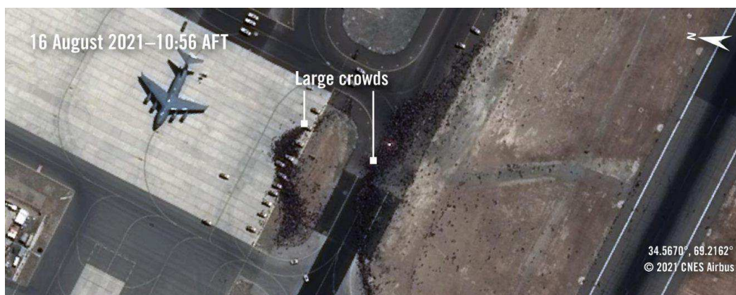
16 August 2021. Kabul Airport.

The thousands who are left behind, or are trying to leave Afghanistan, are testament to the brutal regime of the Taliban circa 2001, when extrajudicial executions abounded, and women and girls were oppressed with a plethora of restrictions. Since then, even in the last 20 years, the Taliban and other armed groups have conducted brutal attacks on civilians, journalists, human rights defenders, and government workers, resulting in Afghanistan having one of the highest civilian deaths in the world. 32 Nearly 50,000 civilians have died in the last 20 years. 33 The first half of 2021 alone recorded 5183 civilian casualties (1,659 deaths and 3,524 injuries), of which 32 per cent were children. This is a 47 per cent increase in civilian casualties compared to the same period in 2020. 34 Those responsible for these casualties include both anti-government and pro-government forces. 35