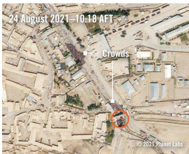
Spin Boldak-Chaman crossing. 24 August 2021.

For instance, according to UNHCR, Pakistan closed its border with Afghanistan, except for people in need of medical treatment, or with a proof of residency. 186 Despite that, at the Spin Boldak-Chaman border crossing in Kandahar, people with Tazkira (National ID Card) from Kandahar, Helmand, Zabul, and Uruzgan were allowed to cross the border. Between 2 August 2021 and 24 August 2021, the crowds attempting to cross the border to Pakistan via the Spin Boldak crossing increased exponentially, as documented via satellite imagery (see above) and video analysed by Amnesty International.