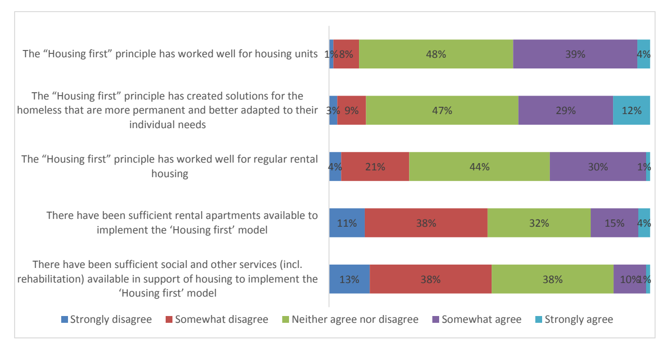
Figure 2. Effectiveness of the Housing First model over the different dimensions (n = 81)

In the course of the AUNE Programme, there would have been a need to construct new housing with the investment aid for special groups granted by the Housing Finance and Development Centre of Finland (ARA), especially for those homeless people who are particularly difficult to house and who have not received adequate support for scattered housing options. Small housing units that offer tailored support best meet the needs of this group of homeless people. Although a large number of apartments were built in the course of the Programme, the majority of them are not the moderately-priced rental apartments that are needed by the homeless and those facing the threat of homelessness. The greatest quantitative need for apartments is experienced in major urban growth centres where the population is increasingly concentrated. The AUNE Programme was also useful in developing new work practices that allow housing services and social services to jointly ensure that homeless people find their way into such apartments. Municipalities, however, fail to provide enough housing options and related support services, and therefore the opportunities for homeless people to exert influence, enshrined in the Housing First principle, remains unrealised. The inclusion of homeless people in society has also been somewhat neglected.