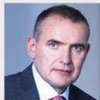
GUÐNI TH. JÓHANNESSON

— President of the Republic of Kosovo (2010–2013), Member of the Council of Women World Leaders