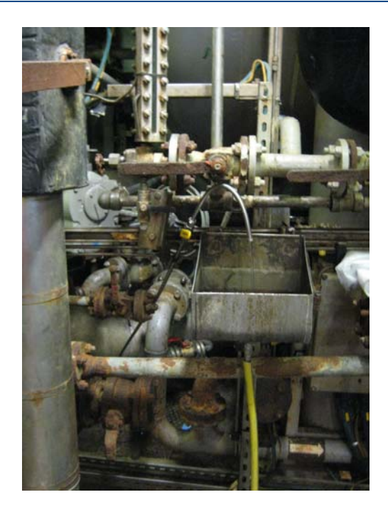
Figure A4.3 Sampling Point, Dan FC

Approximately one year ago, the Dan FF installed a continuous OiW monitoring system at the exit end of the degasser; please refer to Figure A4.4 below.