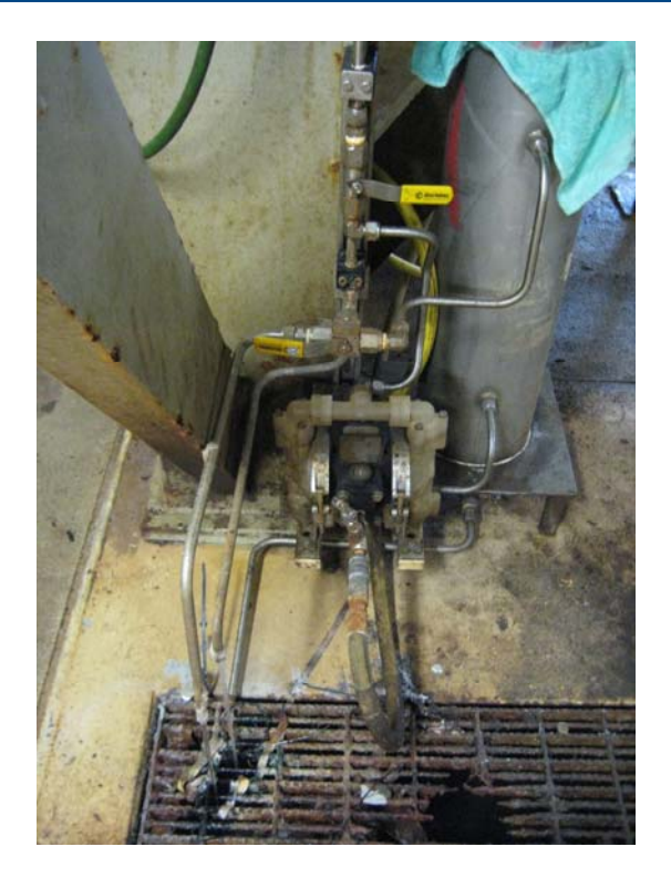
Figure A4.1 Sampling Point and Online Monitor Discharge, Dan FF