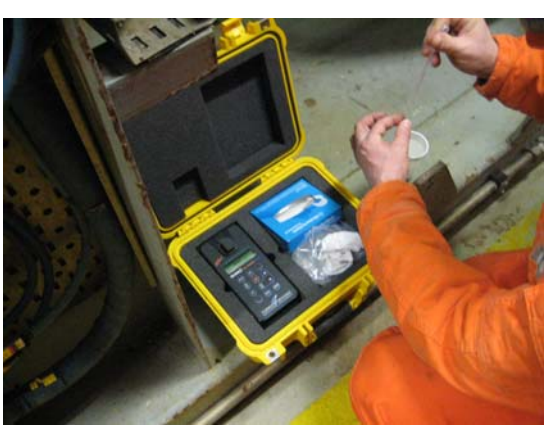
Figure A5.4 Quick Analysis of Skjold OiW using Turner TD5000

Prior to sampling, clean sample bottles are pre-prepared in the laboratory with the addition of 5 ml (6M) hydrochloric acid. Implementation of the procedure (OPM 2b, Part 3, Rev 9. 2010-09-13) was witnessed in the laboratory for the two morning samples (Gorm F and Skjold discharge points). This specifically included Sections 5.1 (Extraction), Sections 5.2 (Chromatography), Sections 5.3 (Setting and Adjustment of the Wilks Infracal) and Sections 5.4 (Analysis and Calculation). In addition laboratory practices relevant to Section 7 (Glassware Cleaning and Rinsing) were observed. It was noted that eye and hand protection was not worn throughout the analytical procedure.