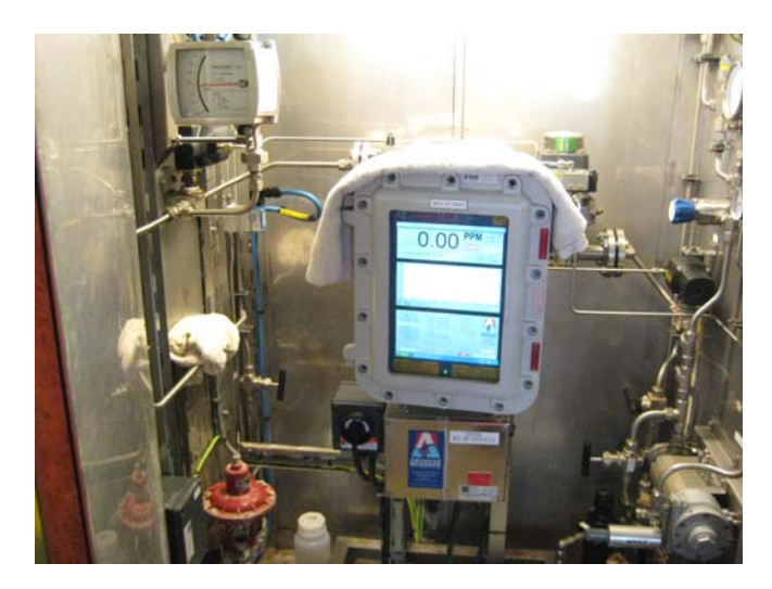
Figure A4.4 Continuous OiW Monitoring System EX1000 (Advanced Sensors), Dan FF

Approximately one year ago, the Dan FF installed a continuous OiW monitoring system at the exit end of the degasser; please refer to Figure A4.4 below.