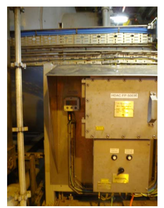
Figure A3.2 Continuous in-line Laser Induced UV Florescence Monitor

Some aspects of the treatment train are subject to continuous monitoring and the results are displayed in the Control Room on the Scada System. In addition to this monitoring, for the past month the discharge point from each degasser (adjacent to each sampling point) has been monitored by a continuous in-line Laser Induced UV florescence monitor (Argus type by ProAnalysis); see Figure A3.2 below.