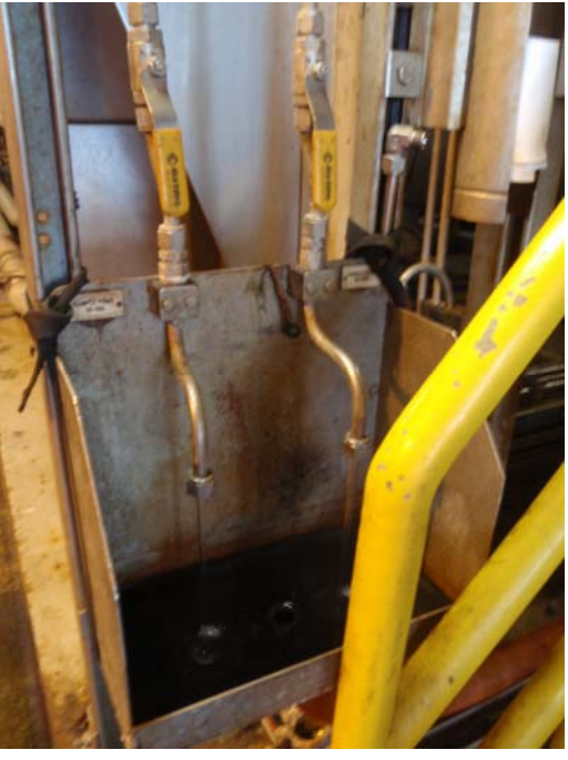
Figure A3.1 Post Treatment Sampling Points

The water treatment process was described and demonstrated to the review team by the on-shift Production Technician. The treatment train includes the separator (V3402), three hydrocyclones (V5012 – 14) and two degassers (V5016 A/B). Although the daily sampling had been completed, the two sampling points were viewed and the sampling process discussed. The continuously flowing sampling points are located after the final degasser treatment process (see Figure A3.1 below) and before discharge to the caisson. Individual samples collected from each treatment train are analysed and reported as a mean concentration. Halfdan does not have laboratory facilities; therefore daily samples are collected and sent by helicopter or boat to the Dan for analysis.