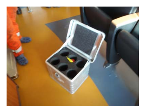
Figure A3.3 Oil in Water Sample packaged for transport to the Dan

Timely transfer of the Halfdan samples is dependent on the frequency and availability of helicopter flights. It is noted that samples that are considered to be urgent (i.e. to confirm potential treatment problems) can be sent by boat to the Dan laboratory for expedited analysis in 5 to 6 hours. Flight delays have resulted in several days' accumulation of uncollected samples. It was not clear how the samples were stored during these periods in order to maintain sample integrity and custody whilst preventing cross-contamination. It is noted that some samples from the Halfdan have gone missing, specifically on 22/04/10.