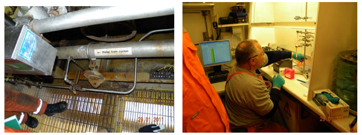
Figure A6.1 Sampling Point on Harald

The treatment process is designed for a higher capacity. From the separator, further OiW treatment is provided by two hydro-cyclones (different sizes) and a degasser (V-5019); from here, the water goes overboard to a caisson. The sampling point was viewed and is downstream of the degasser (Figure A6.1).