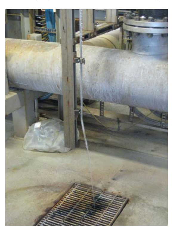
Figure A4.2 Sampling Point, Dan FG