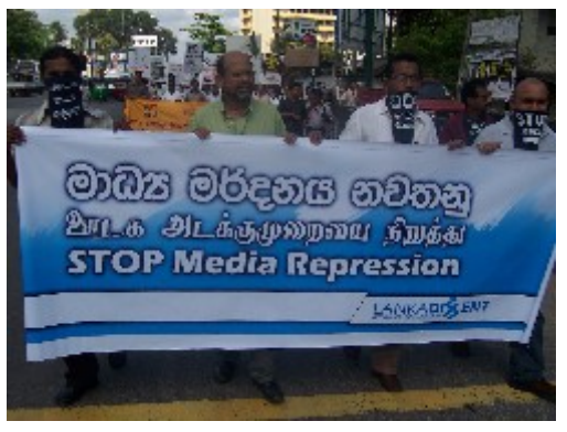
Protestors, Colombo 2007

At the same time, the media themselves have recognised the need to deliver an impartial and professional news service. The Tholangamuwa Declaration of 2005 contains a set of responsibilities that journalists must subscribe to in order to deliver on their professional obligations.<sup>105</sup> The media associations as well as the government must both live up to their commitments