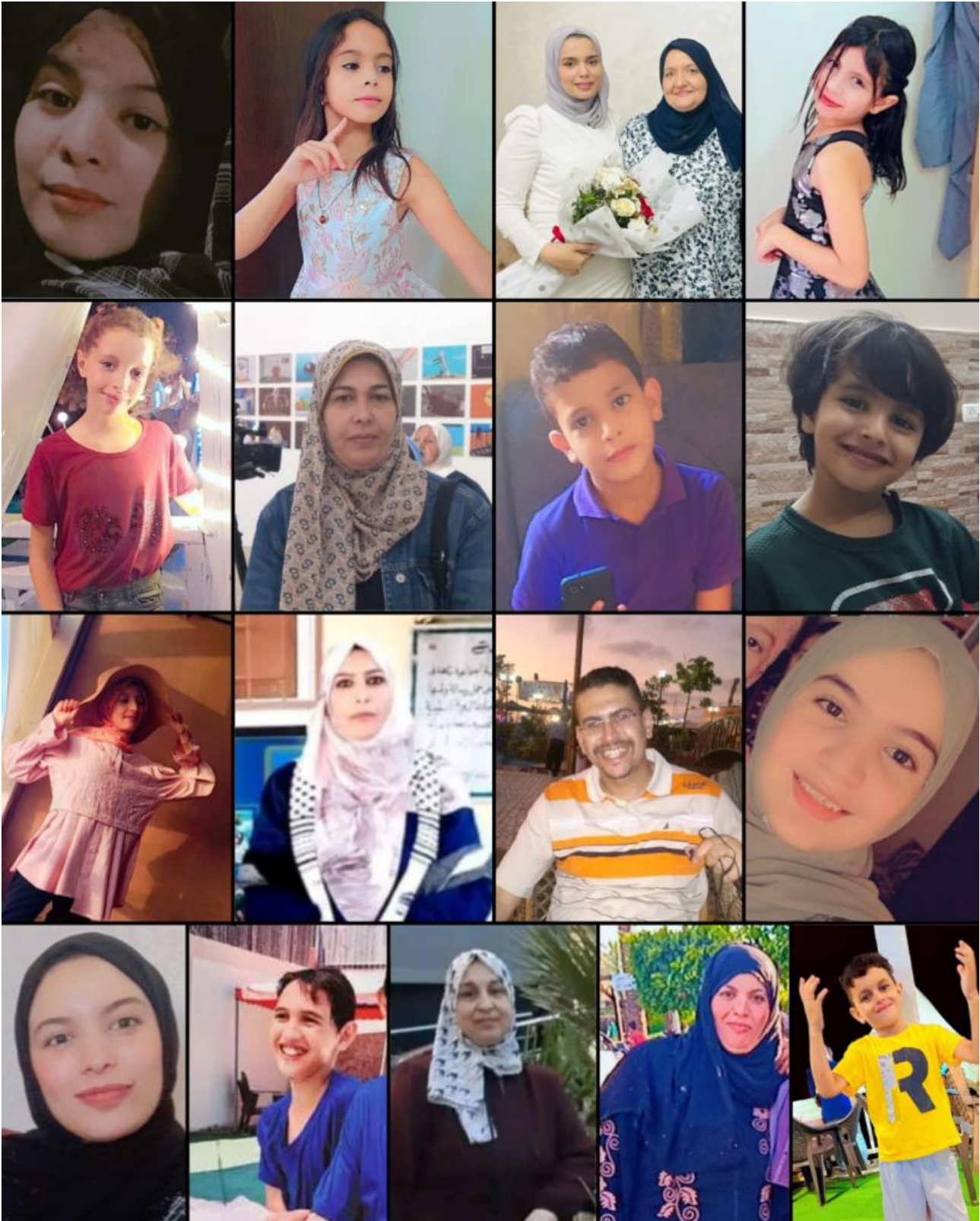
Members of the Abu Mu'eileq family who were killed in the strike.