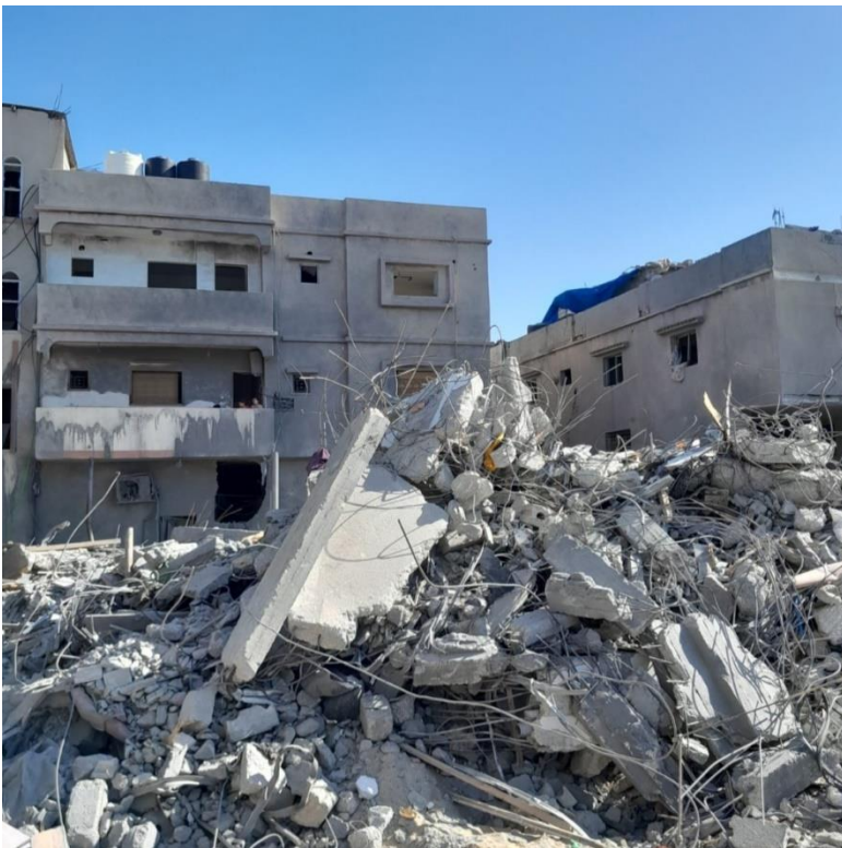
Damage caused to the al-Najjar family home.