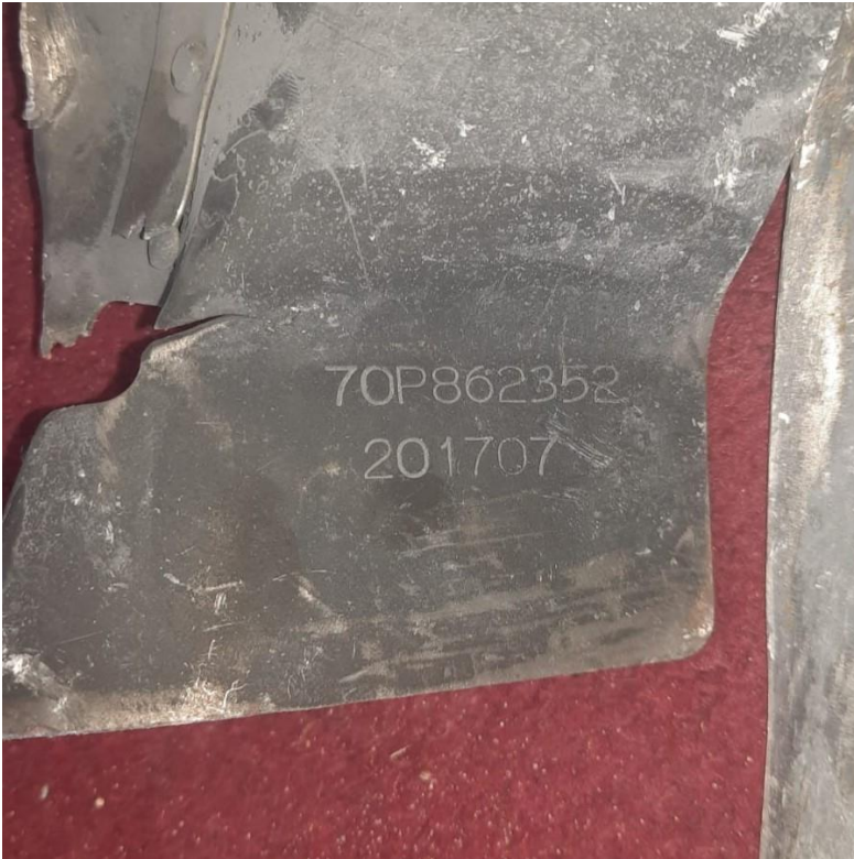
A fragment of the JDAM that struck the al-Najjar family home.