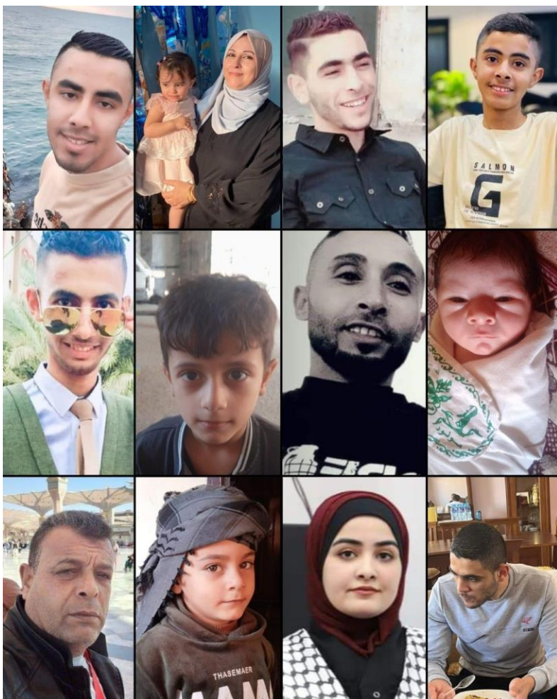
Members of the Al-Najjar family who were killed in the strike.

On 10 October at approximately 8.30pm, an Israeli air strike killed 21 members of the al-Najjar family when the family home in Deir al-Balah was bombed. Three neighbours were also killed.