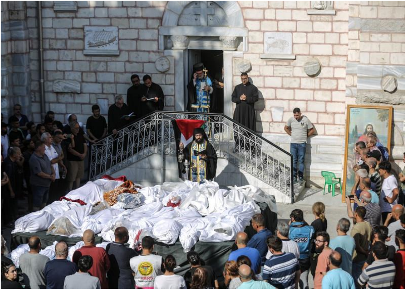
People attend the funeral ceremony for victims who lost their lives in Israeli attack on Church of Saint Porphyrius in Gaza City, Gaza on October 20, 2023.