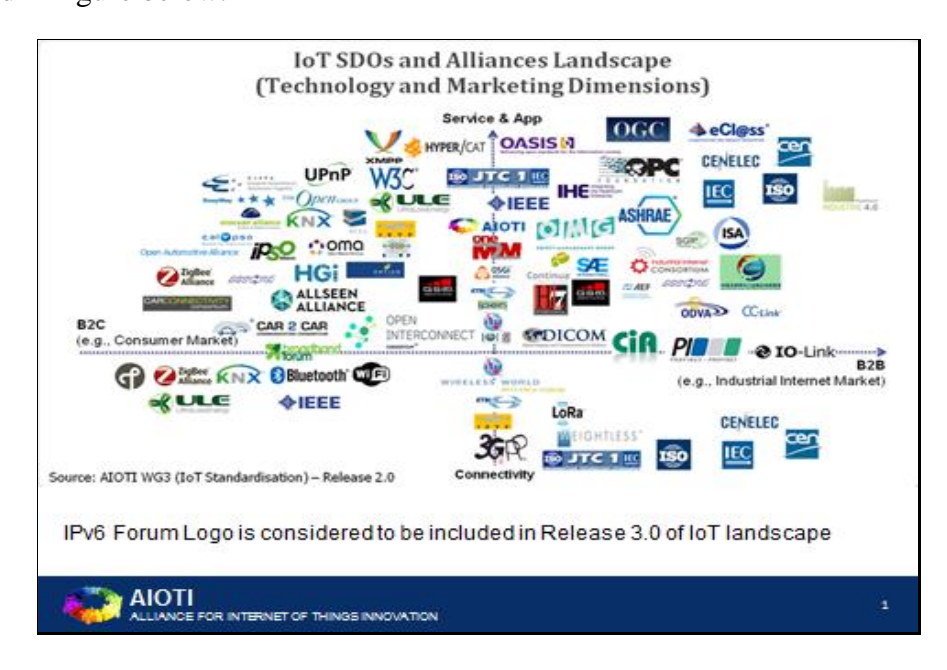
Figure 2: IoT SDOs and Alliances landscape

AIOTI identified a very significant number of IoT alliances, which have a specific positioning and sometimes overlap in their aim. This may characterise the still emerging nature of the IoT but it may also represent a risk of fragmenting the IoT landscape, as illustrated in figure below.