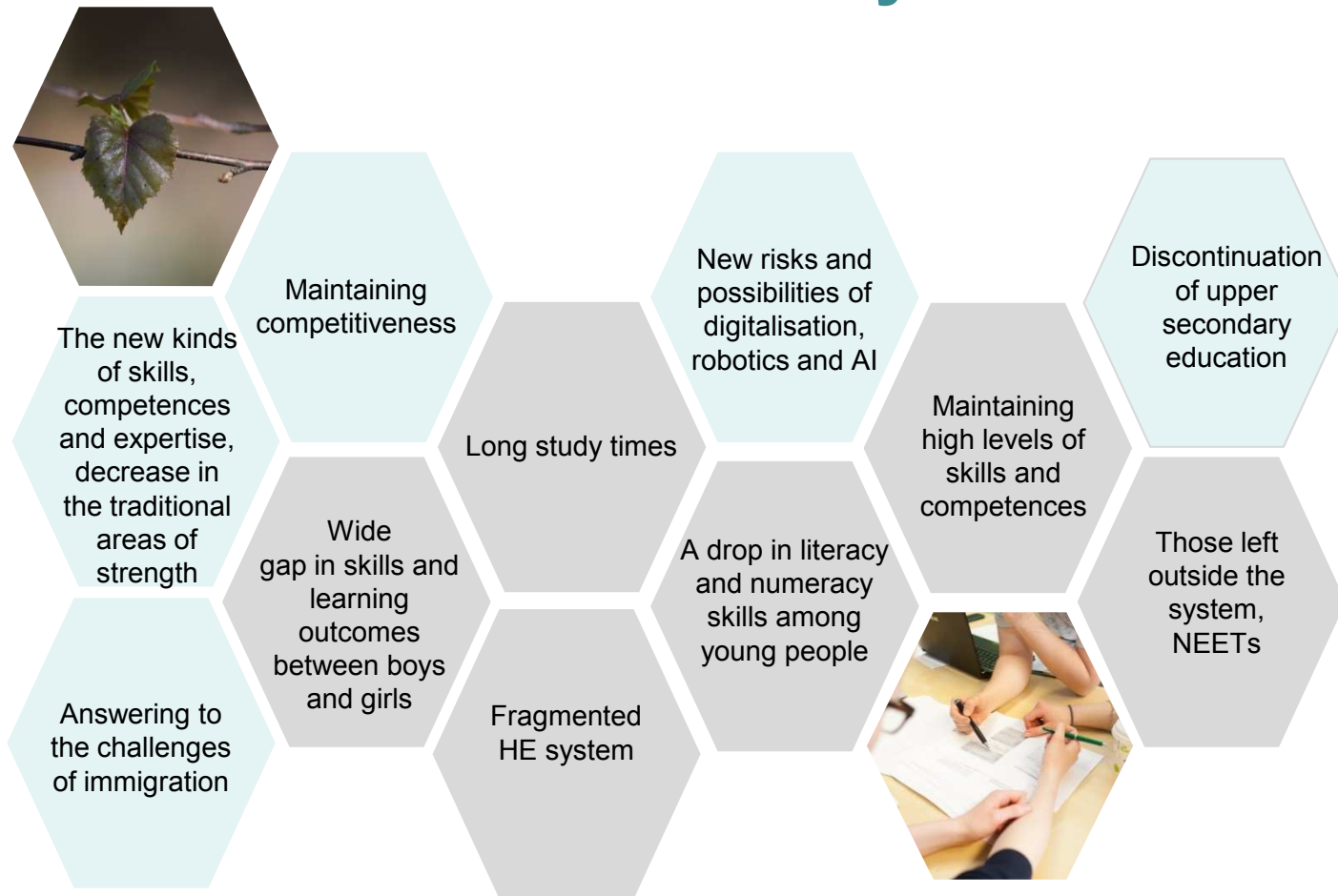
Text sources, paraphrasing: Research and innovation policy outline for 2015-2020, January 2016, European Commission, February 2016