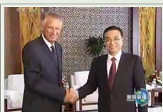
Li Keqiang, Vice Premier of China met with Dominique de Villepin, former French Prime Minister and Global Chairman of APCEO at the 5th ICS 2009 held by APCEO.