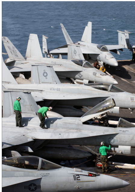
Sailors perform routine maintenance on an F/A-18E Super Hornet aboard the aircraft carrier USS Ronald Reagan.

Key elements of the Integrated Logistics Support program are an extensive onboard fault monitoring system that provides accurate fault detection (>95%) and fault isolation (>98%). Performance-Based Logistics (PBL) programs are demonstrating significant improvements in spare parts availability, repair turnaround time and the optimization of spare parts forecasting. These features enable the Super Hornet to be employed with exceptional operational availability at the lowest possible total ownership costs.