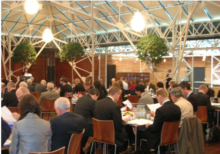
Boeing Supplier Conference in Copenhagen September 11, 2008

logistics support and lean training. Other projects are in accordance with key Danish initiatives in the energy and environment sectors.